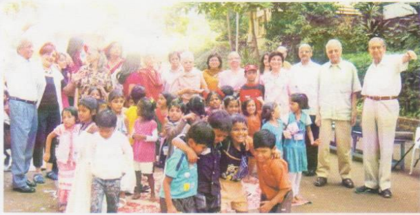
The Lions Club of Mumbai feasted our children during the Christmas period. Besides the games they put up a Magic Show which enthralled each child and adult.

Since November 2011, we have introduced the teaching of YOGA to our little nursery children of Garden School. We are beginning to notice a calming effect on the behavior of these little ones.