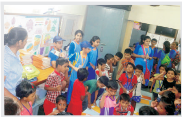
Students of Hill spring International School visited Garden School Children. They were touched by their interaction with the children. We thank them for gifts and toys.